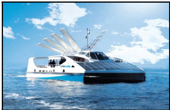
MV Solar Sailor

Captain Cook Cruises (CCC) is a family-owned Australian “small-ship” cruise line that has been in operation since their first “Captain Cook Coffee Cruise” around Sydney Harbor in 1970. Today they operate a fleet of 16 vessels, employ over 500 people, and offer a choice of over 150 cruises weekly throughout Australia and Fiji. xiv