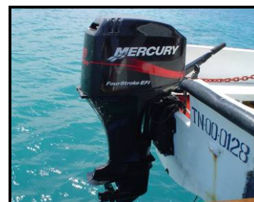
Four-stroke engine

The national park system in the Galapagos does not yet require the use of 4-stroke engines. Replacement of 2-stroke engines was done gradually as the natural life cycle of the current engines occur (approximately every five years).