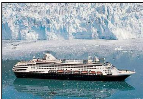
Holland America Alaska cruise (www.destination360.com)

With over 130 years of experience, Holland America Line (HAL) is recognized as a leader in the cruise industry's premium segment. Their fleet is comprised of 13 ships, and they offer nearly 500 cruises from more than 25 homeports. They offer itineraries from two to 108 days and sail to all seven continents.