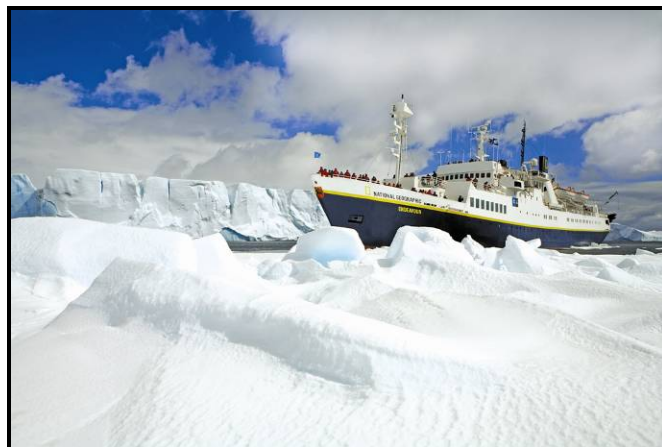
Lindblad Antarctica cruise

While LEX has impacted many of their guests in profound ways, they also realize that more has to be done to enhance and engage public opinion when it comes to climate change. To this end, they are planning an Arctic Summit in 2008 in collaboration with The National Geographic Society and the Aspen Institute. This groundbreaking expedition will bring together world leaders across many disciplines, including science, religion, business, policy, and youth leaders, among others. LEX is hosting this expedition in the hopes that witnessing the effects of climate change first hand will inspire these leaders to collaborate, come up with creative solutions, and then, upon returning home, communicate their experiences, so that the collective impact will be very far-reaching.