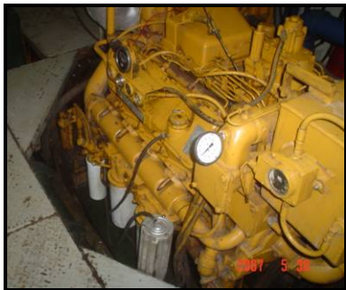
Trabold filter