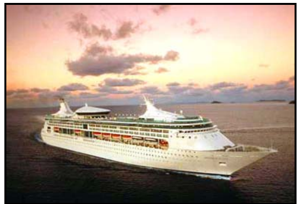
A Royal Caribbean ship

RCI's Save the Waves initiative includes "Reduce-Reuse-Recycle" programs to recycle aluminum and tin cans, scrap metal, plastic, cardboard, paper, magazines, books, fluorescent lamps, batteries, electronics, cooking oil, oily rags, toner cartridges, and glass. In some ports, these items cannot be recycled but when they are, all proceeds are returned to the "crew fund" for events and activities, thereby encouraging crew members to be good environmental stewards.