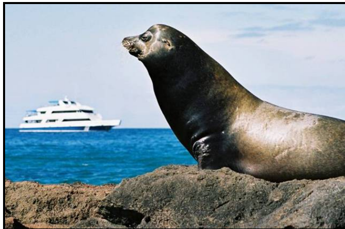
Cruise lines whose boats take backstage to the environment